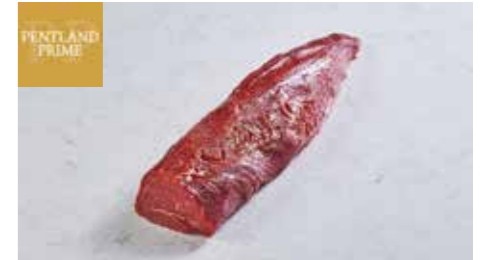
18184 Pentland Prime Fillet Whole Scotch per kg £49.99