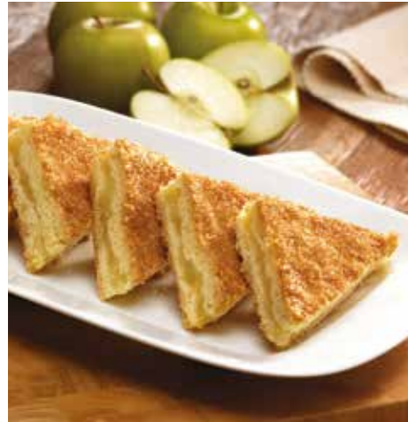
23968 The Handmade Cake Company Apple Shortcake Traybake 1x 12p/ptn £17.36 | £1.45 ptn

Add a festive touch to your cake display this Christmas with one of these delightful sweet treats.