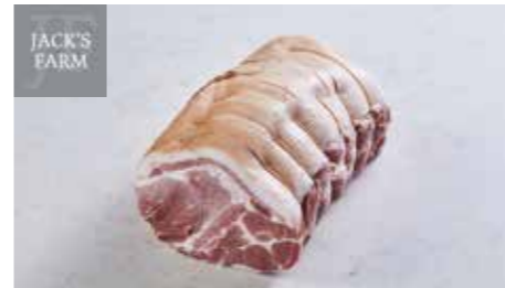
59137 Jack's Farm Pork Shoulder Boneless per kg £10.04