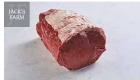
50715 Jack's Farm Topside Scotch 4kg per kg £14.50