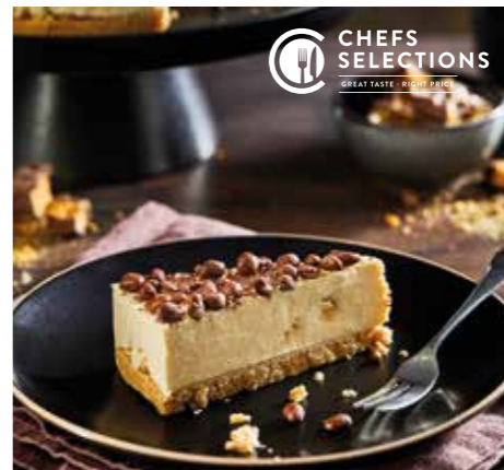
30486 Chefs' Selections Golden Honeycomb Cheesecake 1 x 14p/ptn £23.80 | £1.70 ptn Digestive biscuit and honeycomb cheesecake, topped with chocolate honeycomb pieces.