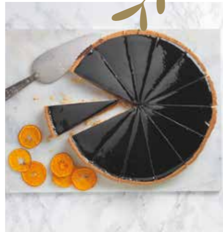
77157 Destiny Foods Vegan & Gluten Free Chocolate & Orange Tart 1 x 14ptn £22.99 | £1.64 ptn