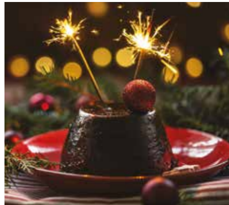
Matthew Walker 80404 Individual Christmas Puddings 36 x 100g £44.67 | £1.24 each 98959 Single Xmas Pudding Loaf 1 x 1.25kg £9.49

Add the cherry on top of your Christmas dinner with one of these delicious desserts.