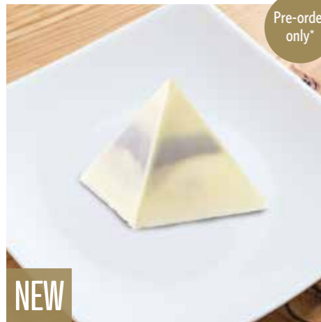
NEW 67147 Destiny Foods White Chocolate Pyramid 1 x 12 £36.65 | £3.05 each Eye-catching white chocolate pyramids filled with white chocolate mousse and caramel cream.