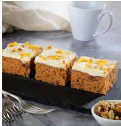
83858 The Handmade Cake Company Carrot & Orange Traycake 1x 18p/ptn £23.36 | £1.30 ptn