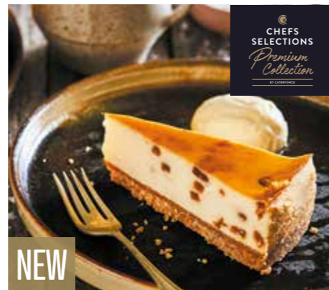
NEW 41068 Chefs' Selections Premium Collection Gluten Free Salted Caramel Ricotta Cheesecake 1 x 14p/ptn £22.12 | £1.58 ptn Biscuit crumb base, baked ricotta cheesecake with salted caramel pieces, topped with a Caramel Glaze.