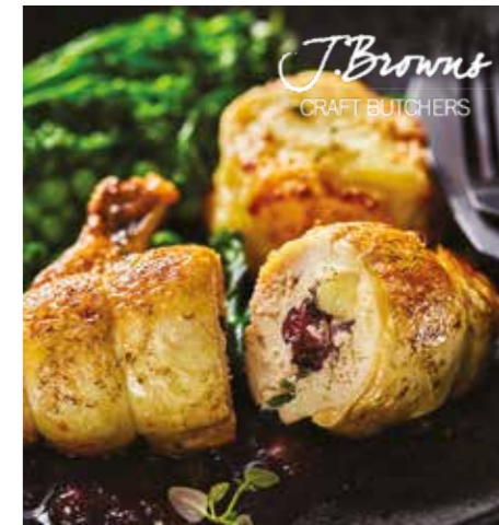
17146 J. Browns Corn Fed Skin on Chicken Supreme 8oz 1 x 4 £13.34 | £3.36 each