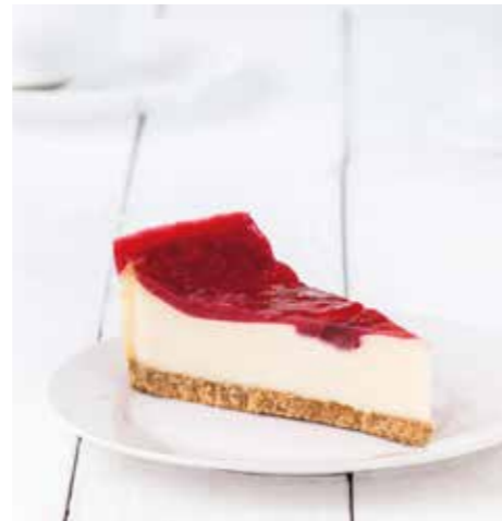
38228 Ministry of Cake White Chocolate & Raspberry Cheesecake 1 x 12ptn £22.27 | £1.86 ptn

A Spicy apple and ginger sponge sprinkled with crumble, toffee sauce and toffee pieces.