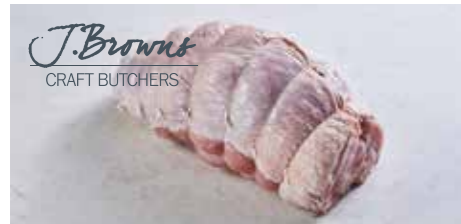
72090 J. Browns Fresh Turkey Crown 4-6kg per kg £8.13