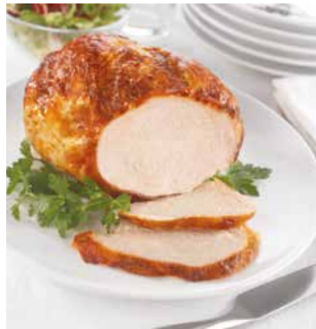
83495 Fenton Barns Easy Roast Turkey Breast 1 x 2.72kg £26.99