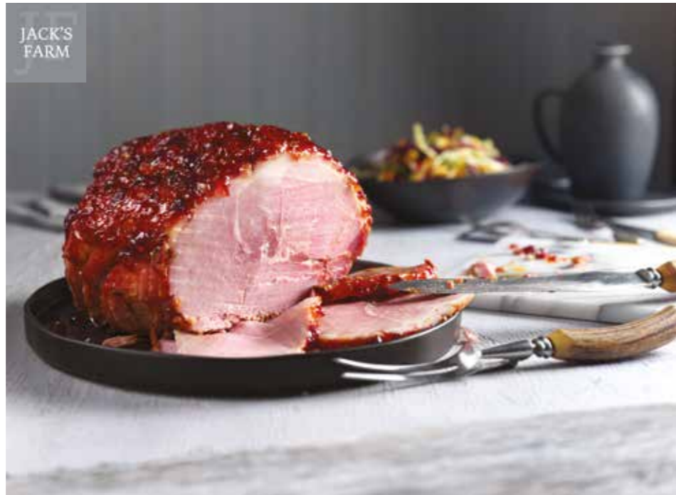
53416 Jack's Farm Horse Shoe Gammon Rind on per kg £6.99