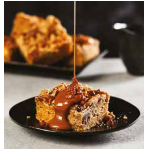
96246 The Handmade Cake Company Toffee Apple Traycake 1 x 18ptn £22.51 | £1.25 ptn

A Spicy apple and ginger sponge sprinkled with crumble, toffee sauce and toffee pieces.