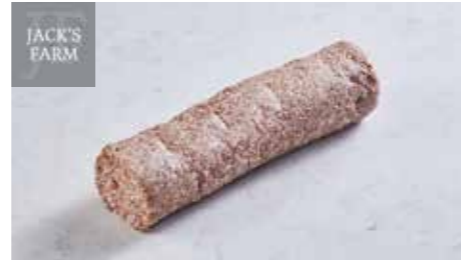
42860 Jack's Farm Cranberry Stuffing (Frozen) 1 x 1kg £5.99

*Subject to availability supplied fresh or frozen