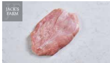
30696 Jack's Farm Fresh Turkey Escalope per kg £11.50