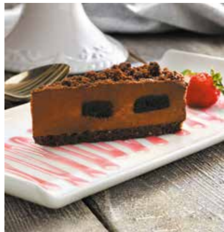
27689 Aulds Vegan & Gluten Free Chocolate Truffle 1 x 14p/ptn £19.49 | £1.39 ptn