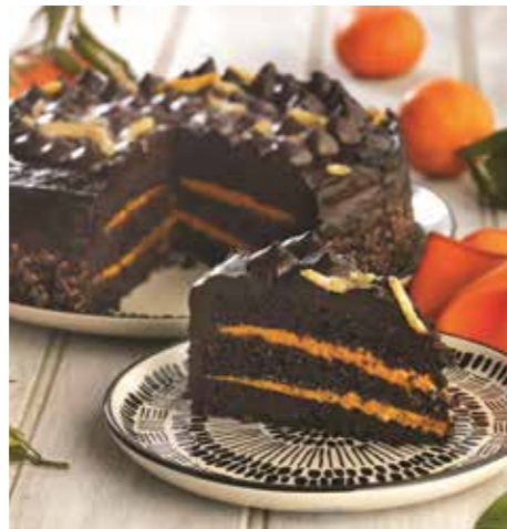
44153 Ministry of Cake Vegan Chocolate & Orange Cake 1x 14ptn £23.58 | £1.68 ptn