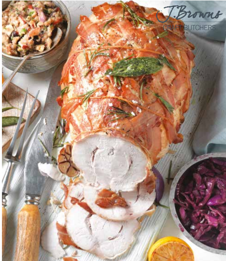
72090 J. Browns Fresh Turkey Crown 4-6kg per kg £8.13 47807 J. Browns Freshly Frozen Turkey Crown 4-6kg per kg £7.50 64482 Fenton Barns Cooked Turkey Carvery Saddle 1 x 8.3kg £69.80 Cooked, boneless turkey breast saddle joint. A great ready to eat alternative.