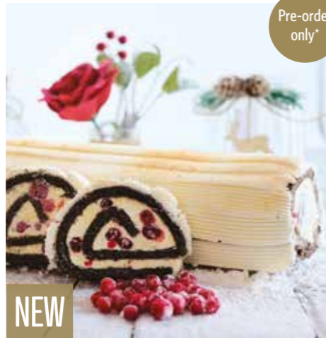
NEW 84924 Destiny Foods Snowy Yule Log 1 x 1 £18.38 Vanilla and redcurrant filling rolled in a chocolate sponge and finished with vanilla frosting. Uncut.