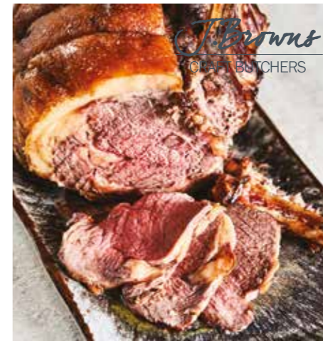
96468 J. Browns Whole Rib Roast Bone in trim Scotch Dry Aged per kg £33.97