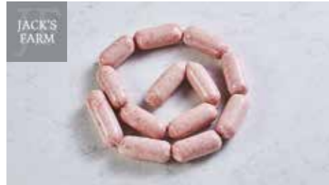
20587 Jack's Farm Chipolata Pork Sausages per kg £5.99

Our on site craft butchers offers a large range of fresh produce, with over 85% Scottish origin. Here is a selection of show stopping roasts and festive sides. Take a look at our full range online.