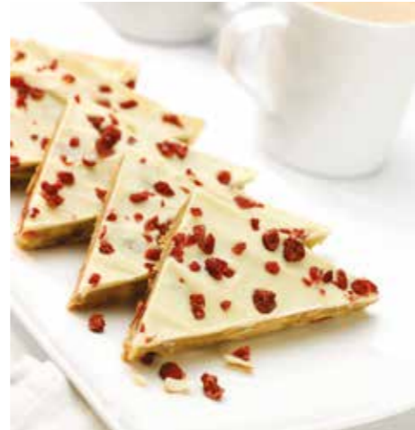
36434 The Handmade Cake Company White Chocolate & Cranberry Tiffin 1x 12p/ptn £20.99 | £1.75 ptn