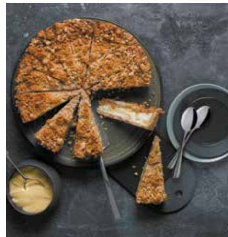
79121 Ministry of Cake Caramel Apple Crumble Pie 1 x 14p/ptn £18.99 | £1.36 ptn