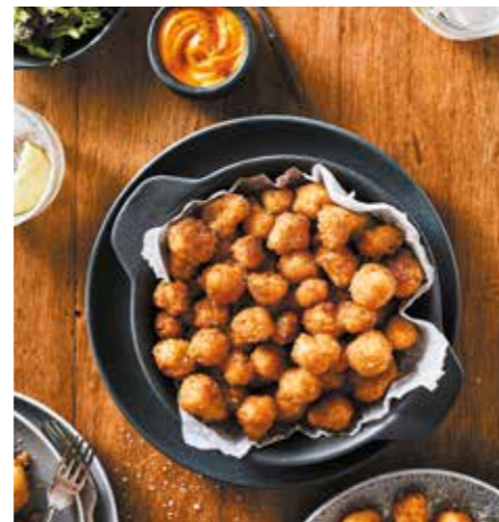
72253 Golden Crumb Cauliflower Bites 1x 1kg £6.18