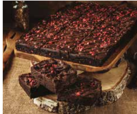
82621 Grazed Gluten Free Golden Topped Brownie 1x 18ptn £23.58 | £1.31 ptn