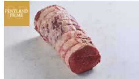
78617 Pentland Prime Chateau Fillet 16oz per kg £35.59