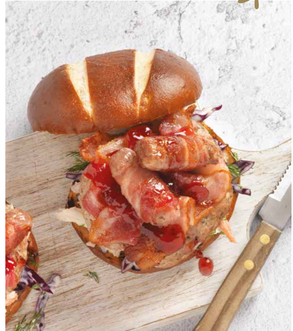
58109 Brown Brothers 80% Sliced Turkey 1x 454g £5.40