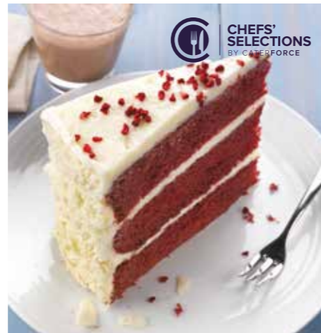
68885 Chefs' Selections Red Velvet Cake 1x 14p/ptn £17.92 | £1.28 ptn