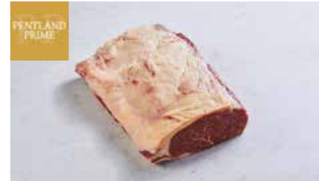
11623 Pentland Prime Striploin Half Scotch 4kg per kg £39.99