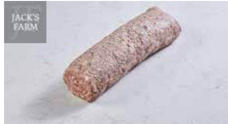
51562 Jack's Farm Sage & Onion Stuffing 1 x 1kg £5.99

*Subject to availability supplied fresh or frozen